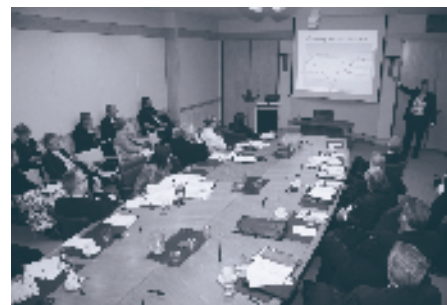
International program audience