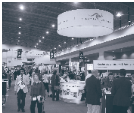
Twelve senior executives were part of the Canada/US TDA Mission, with the 2008 NAFSA Expo one highlight, in Washington

on access to the China market to the House of Representatives Education and Training Committee, mainly outlining blockages to collaborative agreements which had arisen from apparent issues caused by private providers operating in the Greater China market. The Committee later questioned DEEWR on the issues, and is continuing with its enquiries.