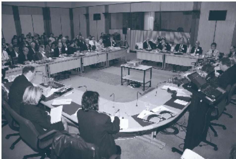
TAFE MEETS Parliament in the Senate Estimates Room