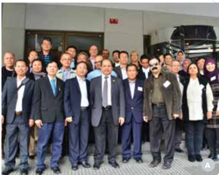
A: East Asia TVET Network participants, November 2012.