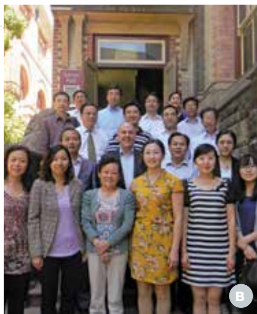
B: China Quality Assurance Study Tour, 17–18 December 2012.