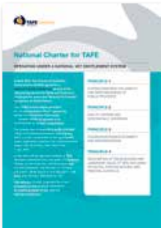
National Charter for TAFE flyer

The National Charter was developed after an exhaustive process of consultation; liaison took place with the Board of Skills Australia, the industry liaison committee of the COAG Standing Council on Tertiary Education, Skills and Employment (SCOTESE) Ministers, business leadership, the TAFE sector itself, along with many federal government officials and state and territory training agencies. TDA argued that key principles which formed the basis of a National Charter would be important for informing the COAG SCOTESE.